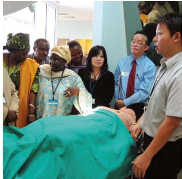
African policymakers visit Asia